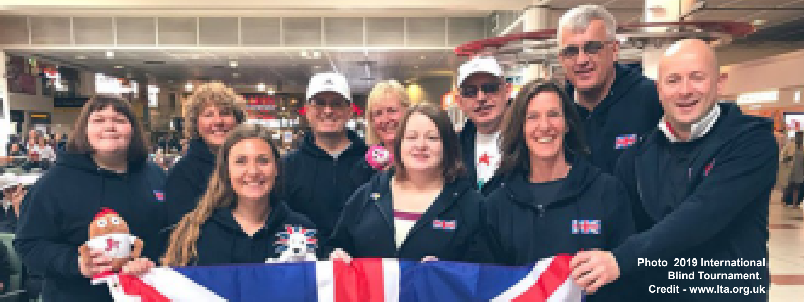
Photo 2019 International Blind Tournament.